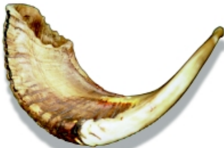
An anointing horn was made of an animal's horn and filled with a special compound of olive oil, myrrh, cinnamon, sweet calamus, and cassia (Exodus 30:22-25).