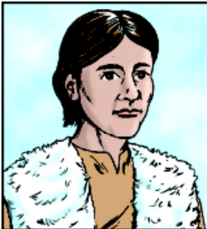
David A lowly shepherd

Noah never thought of greatness. He simply obeyed the Lord. For 120 years he thought of himself as a mere carpenter. The men of his day mocked him and scorned his efforts. His humility was seen in his faithfulness and obedience to the Lord's command.