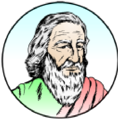
Noah A humble builder

Noah never thought of greatness. He simply obeyed the Lord. For 120 years he thought of himself as a mere carpenter. The men of his day mocked him and scorned his efforts. His humility was seen in his faithfulness and obedience to the Lord's command.